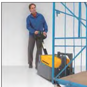
Easy trailer shunting