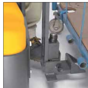
Individual coupling solutions to suit the trailer