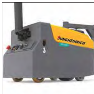
Clearly arranged controls always in view