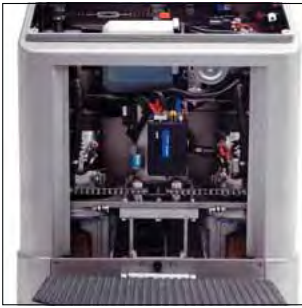
Easy service access to drive compartment